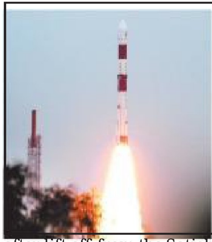
after lift-off from the Satish Dhawan Space Centre (SDSC), about 110 km from Chennai, at 3.12 pm.